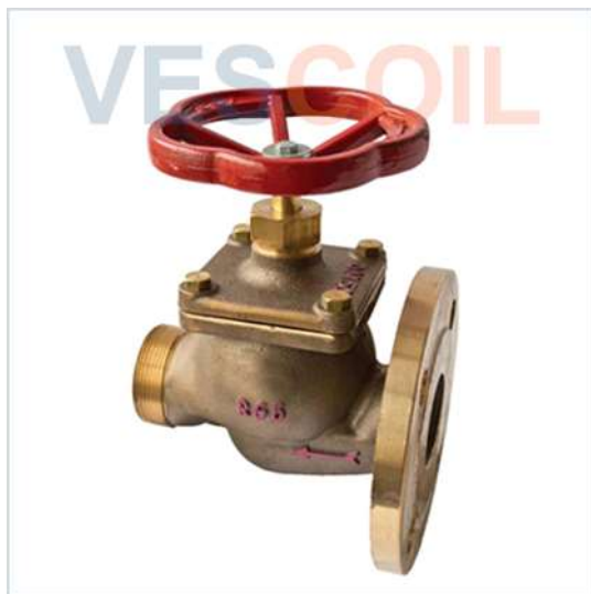
Fig. 9132 | FIRE FIGHTING HYDRANT VALVE DECK WASH STRAIGHT FLANGED - BRONZE - PN10 / PN16 - DN40 to DN65